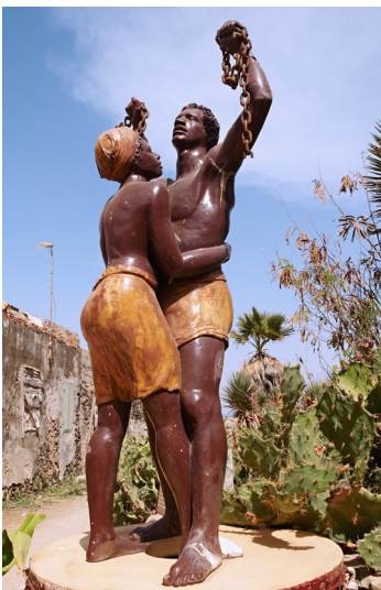
Monument to freedom from slavery, Senegal, West Africa

While enslaved Africans suffered, the owners of the plantations, the slave traders and the businesses back in Europe profited. They were able to buy cheap raw materials and made huge amounts of money. The effects of profits from slavery can still be seen in Britain, from grand public buildings to the fine private houses of the upper classes. However, it was not just rich business owners who benefitted. Many middle-class British people also “owned” slaves (sometimes just one or two) in colonies far away. From the early 17th century for more than 300 years, the money from slavery helped Britain to develop its economy and was a major reason why Britain was able to develop and maintain the richest and most powerful empire the world had ever known – with competition from other European nations which had their own colonies and slavery-based industries.